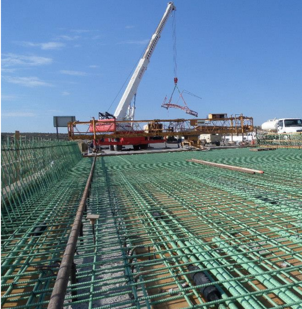
Colton, Loma Linda Bridge

SBE Certifications License No: 831200 Class: B 12 Years in Business